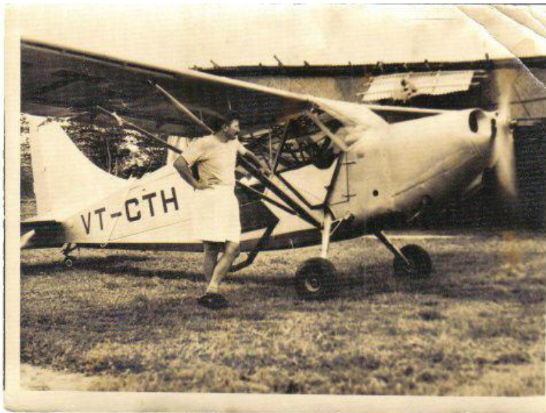
Aircraft on loan from Lucknow Flying Club