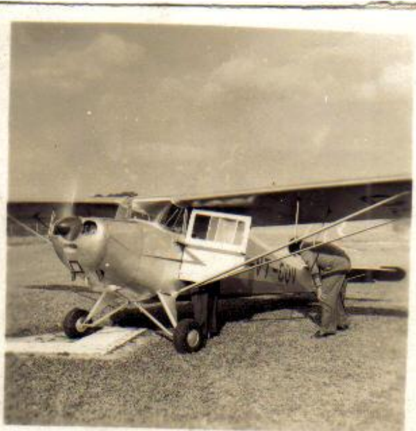
Aeronca after complete overhaul

problems. Then the Indian Government decided that private flying was not to continue in Assam. The Aeronca ended up being sold to a dealer in Calcutta Airport.