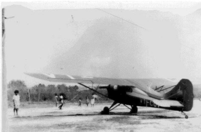
Aeronca Super Chief, before overhaul, Gelakey strip