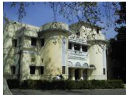
The Psychology and Philosophy building of Lucknow University.

Later, I was the editor of the journal of the University's Department of Psychology and Philosophy for the next three years.