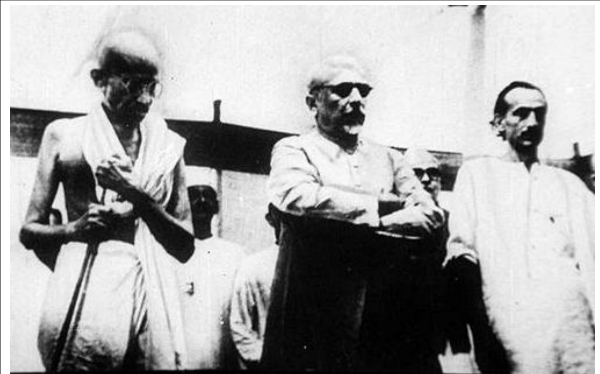
Maulana Azad, centre, with Mahatma Gandhi, left, and Acharya Kripalani, right, at a Quit India rally 1942

A few months after we acquired familiarity with him, in early 1942, Azad disappeared from the scene for almost three years. He was arrested, along with most other senior leaders because of their participation in the Quit India movement in August 1942. We had an idea that he was incarcerated along with Nehru and most of the members of the Congress working committee in the Ahmednagar Fort. (More was known about it after the publication of Nehru's Discovery of India in 1946 while details became public many years later, after the publication of Azad's book India Wins Freedom in 1958). The only news about him I heard during the three years of his incarceration was when his wife died and he was not permitted to meet her before her death. They had no children.