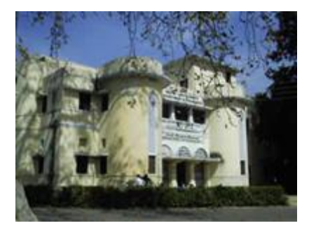
The Psychology and Philosophy building of Lucknow University.

Later, I was the editor of the journal of the University's Department of Psychology and Philosophy for the next three years.